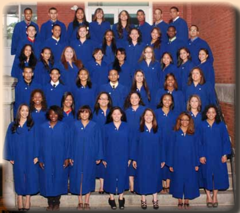
The Class of 2011.